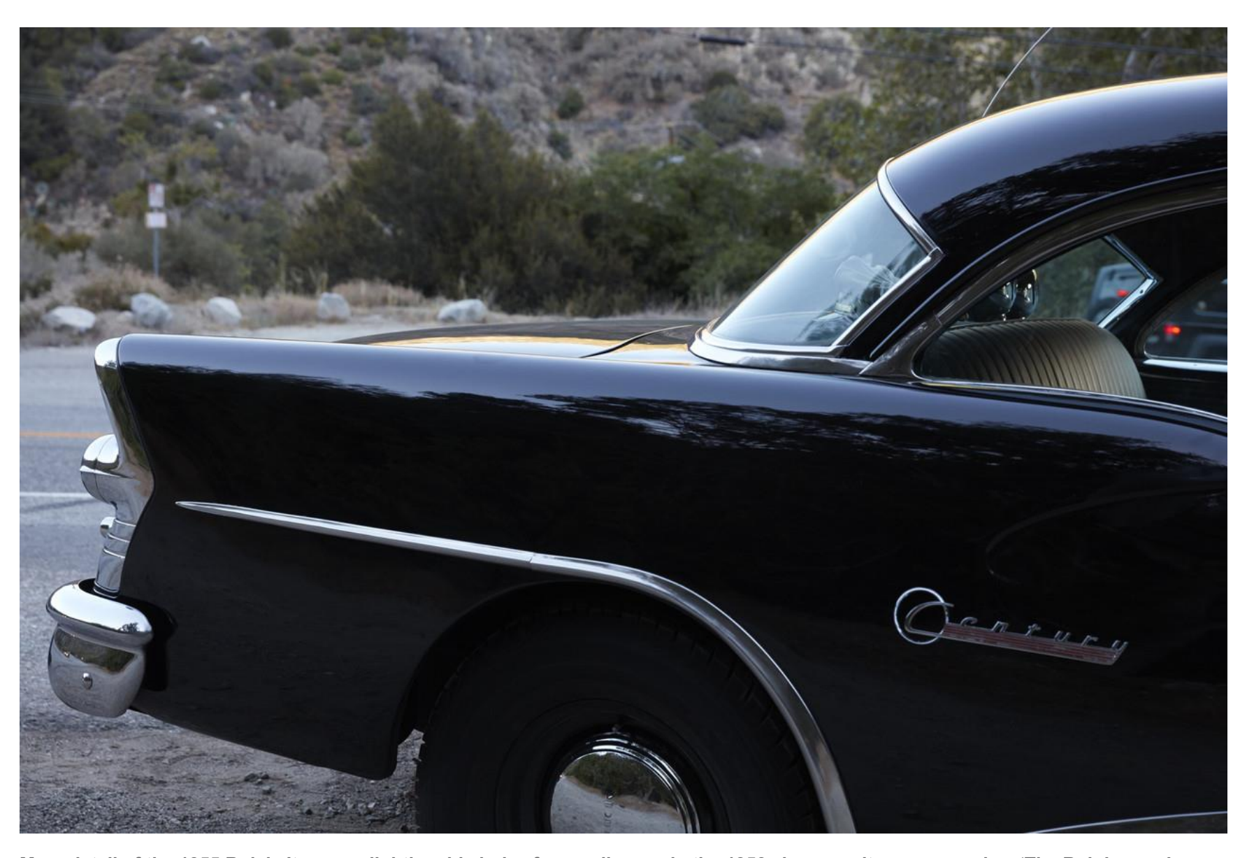
More detail of the 1955 Buick. It was a slightly odd choice for a police car in the 1950s because it was expensive. 'The Buick was the car doctors drove,' say Mr. Goltz.