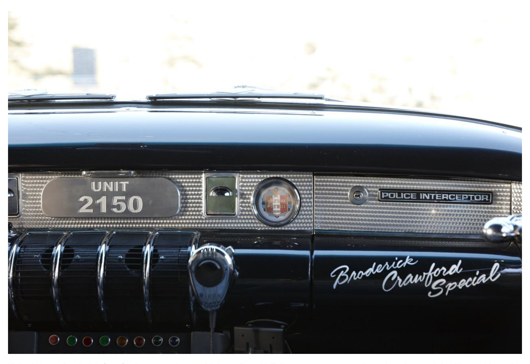
Unit 2150 was Broderick Crawford's car number on 'Highway Patrol.' 'Talk to anyone over 60 about that show and they'll get a big smile on their face,' says Mr. Goltz. GREGG SEGAL FOR THE WALL STREET JOURNAL