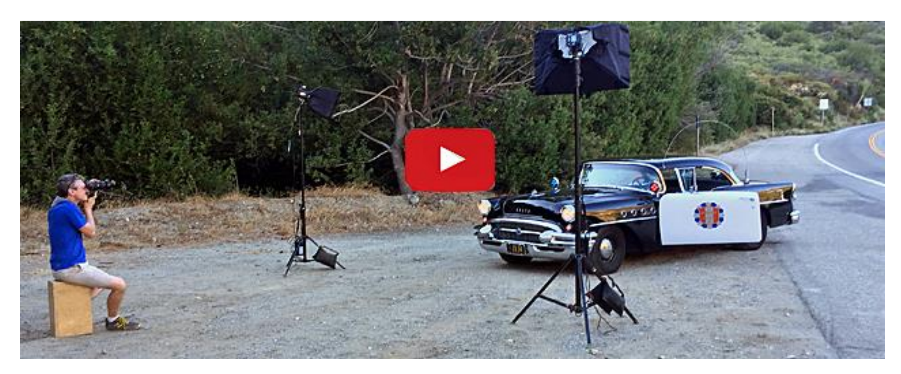
Behind the scenes of the 5-hour WSJ Photo Shoot.

I've owned this car now for 21 years. Every time I take it out, it still draws a crowd.