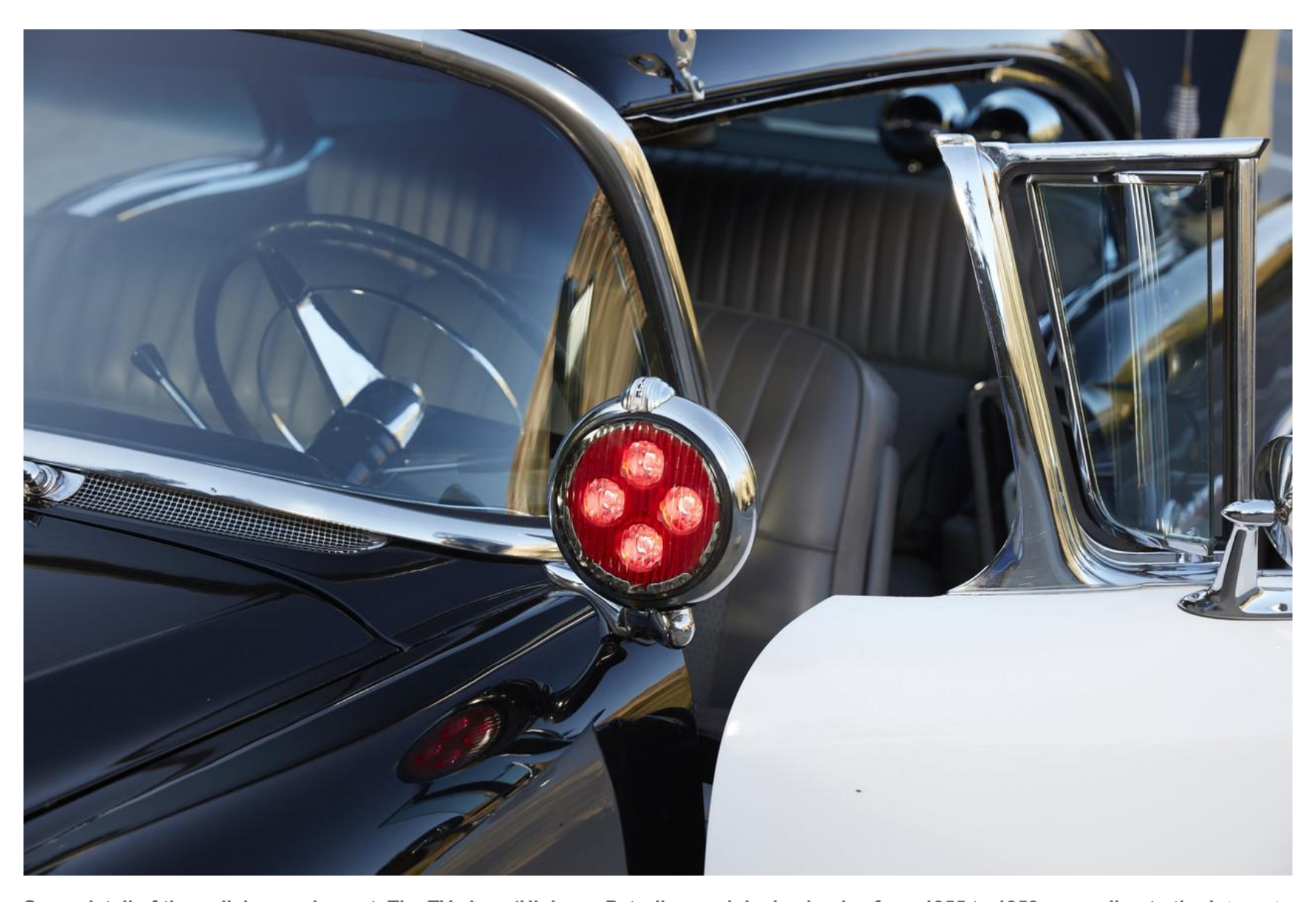
Some detail of the policing equipment. The TV show 'Highway Patrol' ran original episodes from 1955 to 1959, according to the Internet Movie Database, with reruns airing after that.