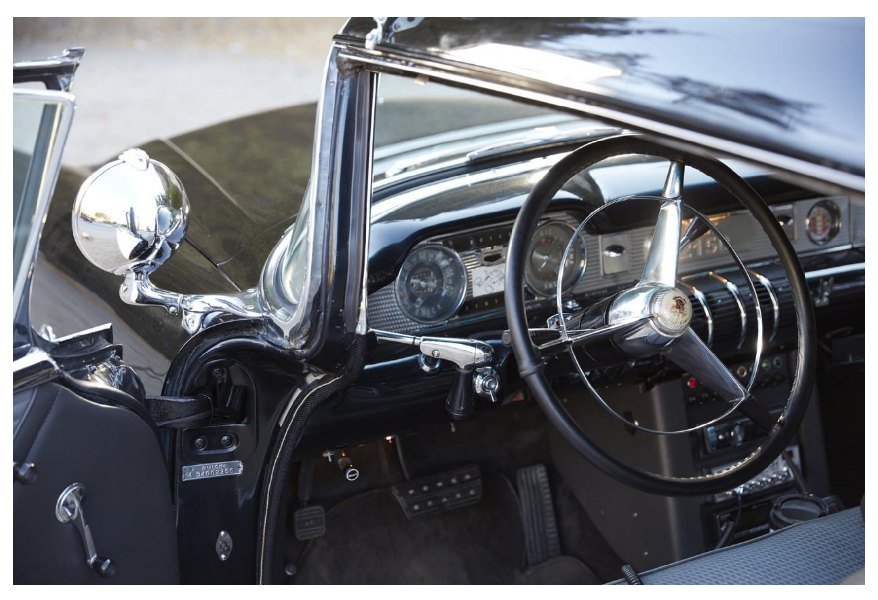
A peak into the car's interior. The Buick was not a cheap car in 1955, and the interior featured elegant art-deco styling.