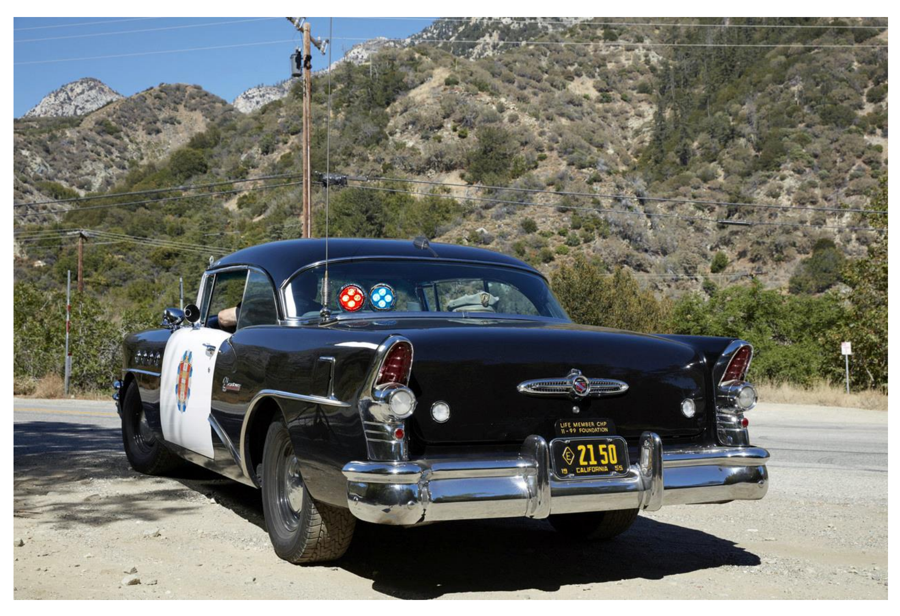
The car from behind, showing the 2150 license plate—Broderick Crawford's car number on the show 'Highway Patrol.' 'Growing up in Pittsburgh and watching that show, the cars looked so different from what police drove where we lived,' says Mr. Goltz.