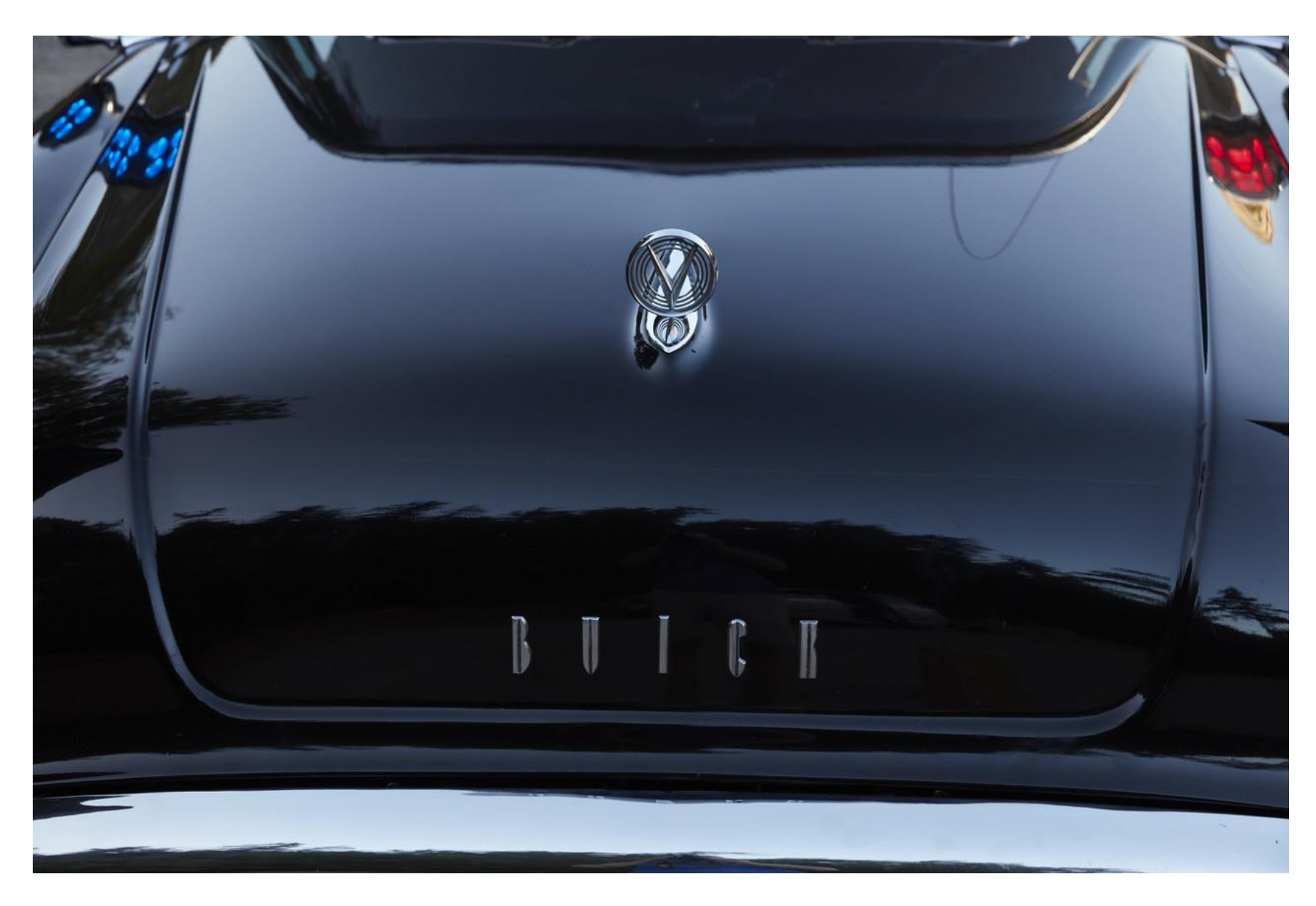
The hood ornament and the Buick logo—classic 1950s styling.