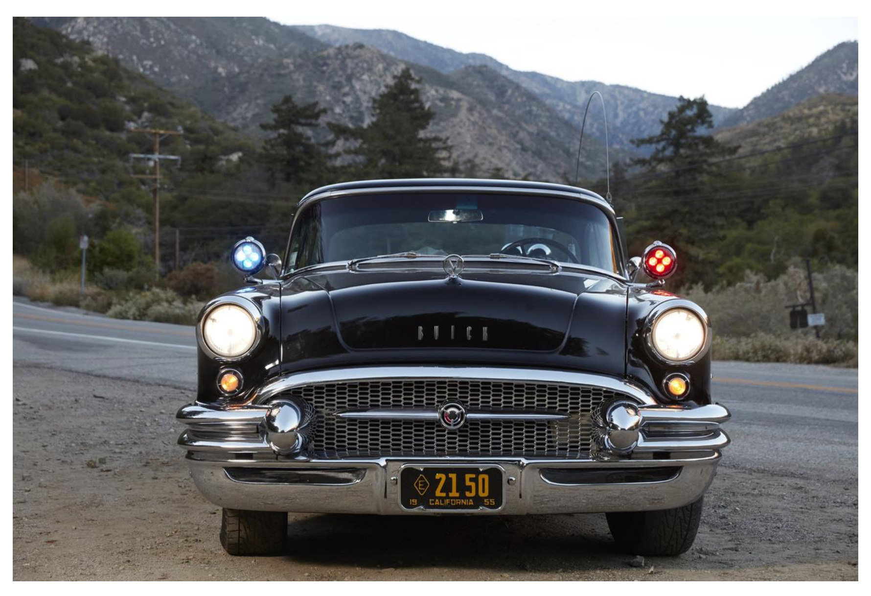
The car's prodigious nose. There's enough chrome on this vehicle to keep its owner busy buffing for hours.