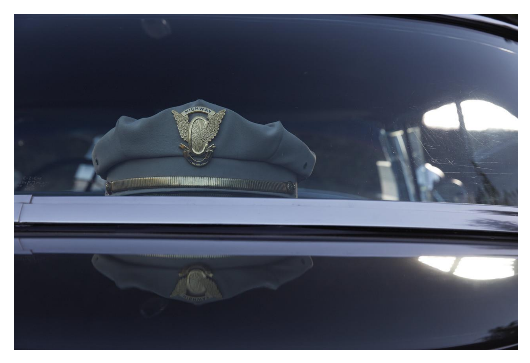
An old highway patrol hat completes the package.